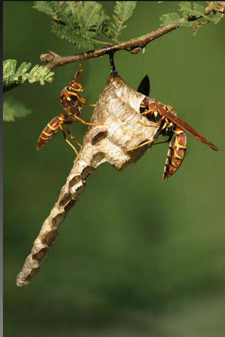
'WASP NEST-7528' BY STEVE BEIN (Best of Show)