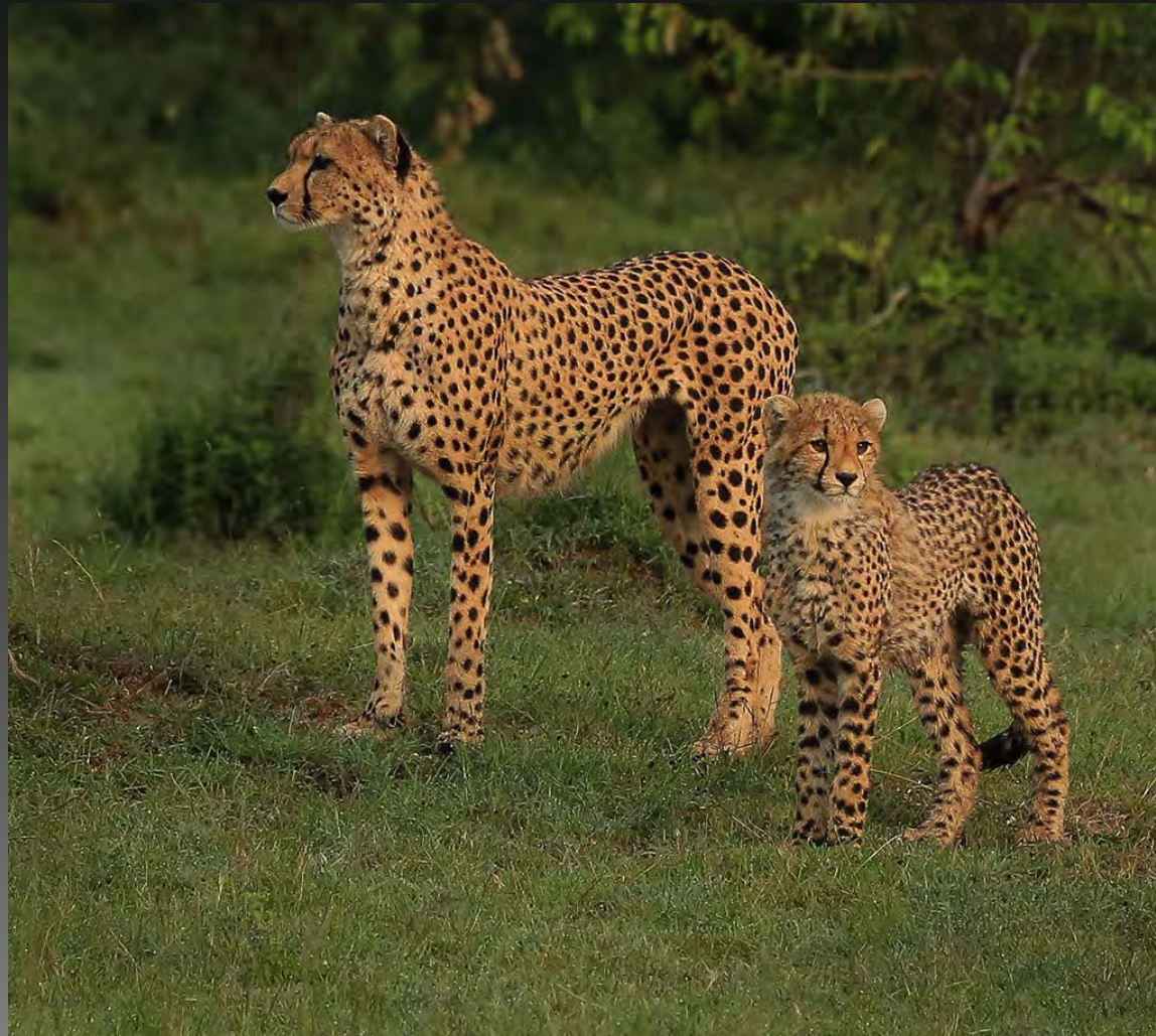
'HUNGRY CHEETAHS' BY SANDRA CRANTZ (Silver Medal)