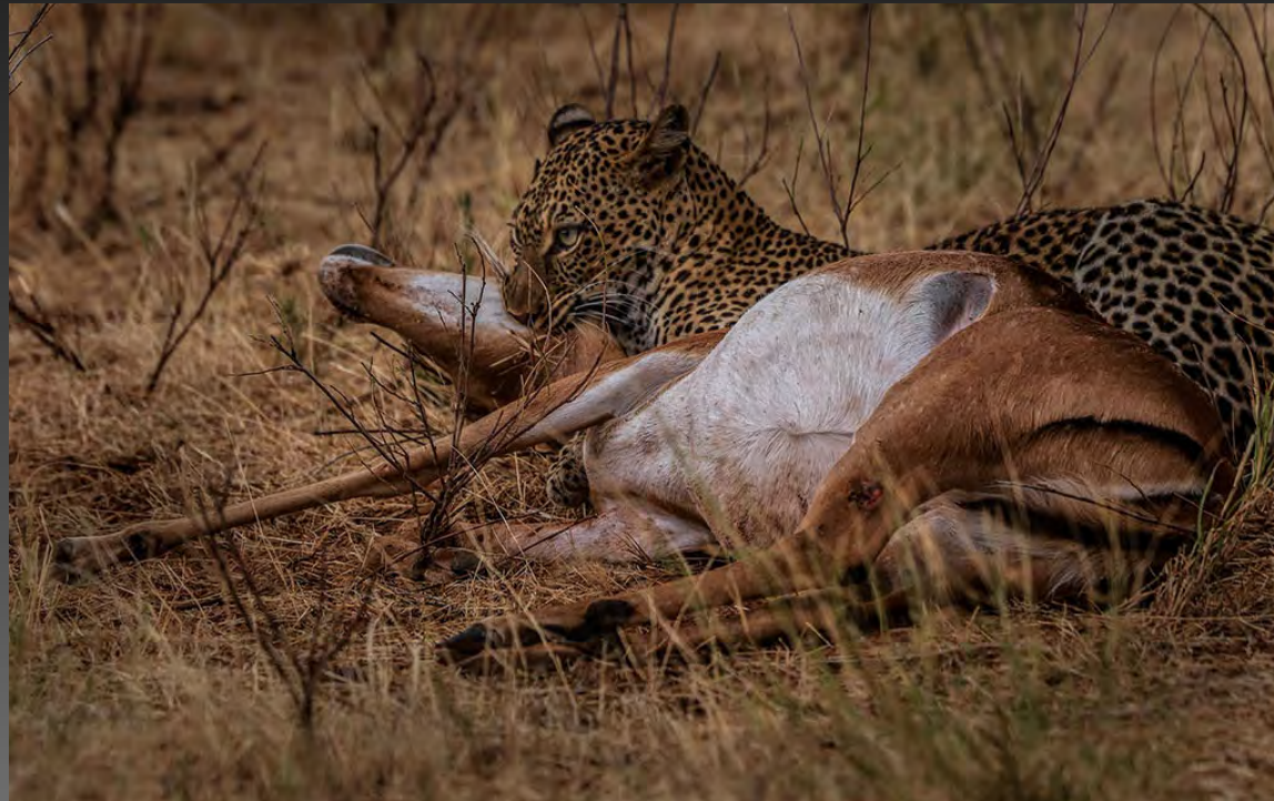
'ALL MINE 1007' BY SANDRA CRANTZ (Gold Medal)