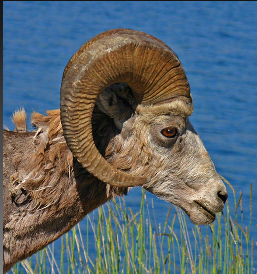
'RAMS HEAD2_' BY PAT DEVORSS (Honor Award)