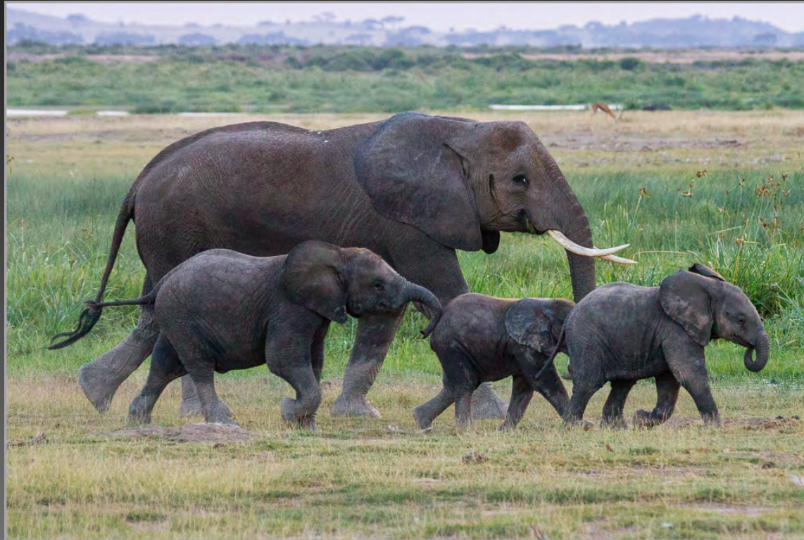
'AMBOSELI ELEPHANTS 9487' (Silver Medal)